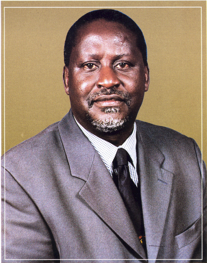
THE RT. HON RAILA AMOLO ODINGA, EGH, MP, MSc, PRIME MINISTER OF THE REPUBLIC OF KENYA